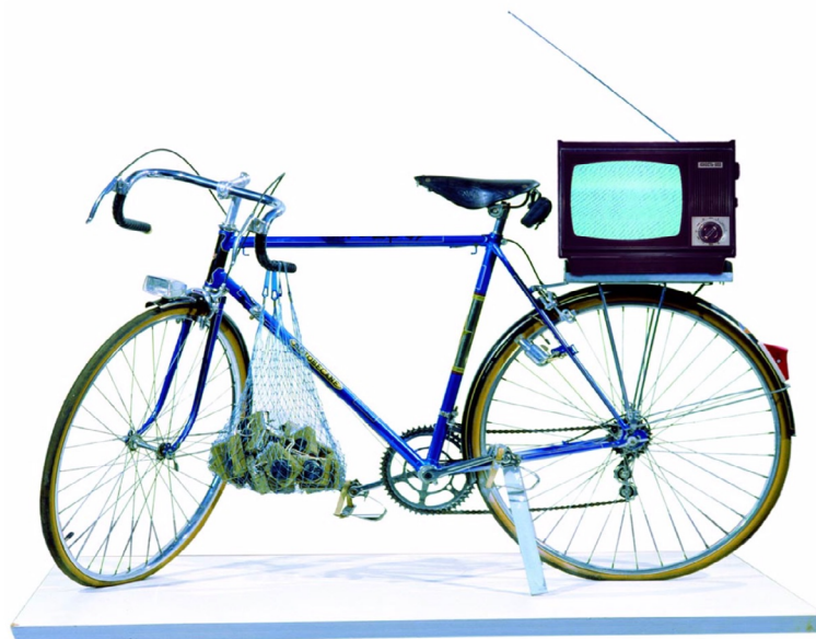
Wolf Vostell, Radar Alarm F, 1969; Racing bike, TV, bag with alarm sirens and cables; 170 x 100 x 90 cm

Works by Wolf Vostell are included in significant museum collections, especially across the United States and Europe, such as MOMA, New York; SFMOMA, San Francisco; Walker Art Center, Minneapolis; Art Institute, Chicago; Nationalgalerie, Berlin; Centre Pompidou, Paris; Museo Reina Sofia, Madrid; MACBA, Barcelona; Art Gallery of New South Wales, Sydney.