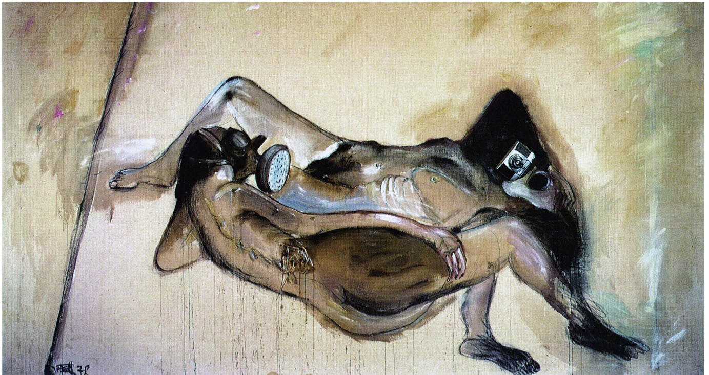
Wolf Vostell, The dead man who is thirsty, 1978; Camera, bird, acrylic, coal on canvas; 190 x 290 x 10 cm

22 Grafton Street, London W1S 4EX (Open Monday - Friday 10am - 6pm & Saturday 11am - 6pm)