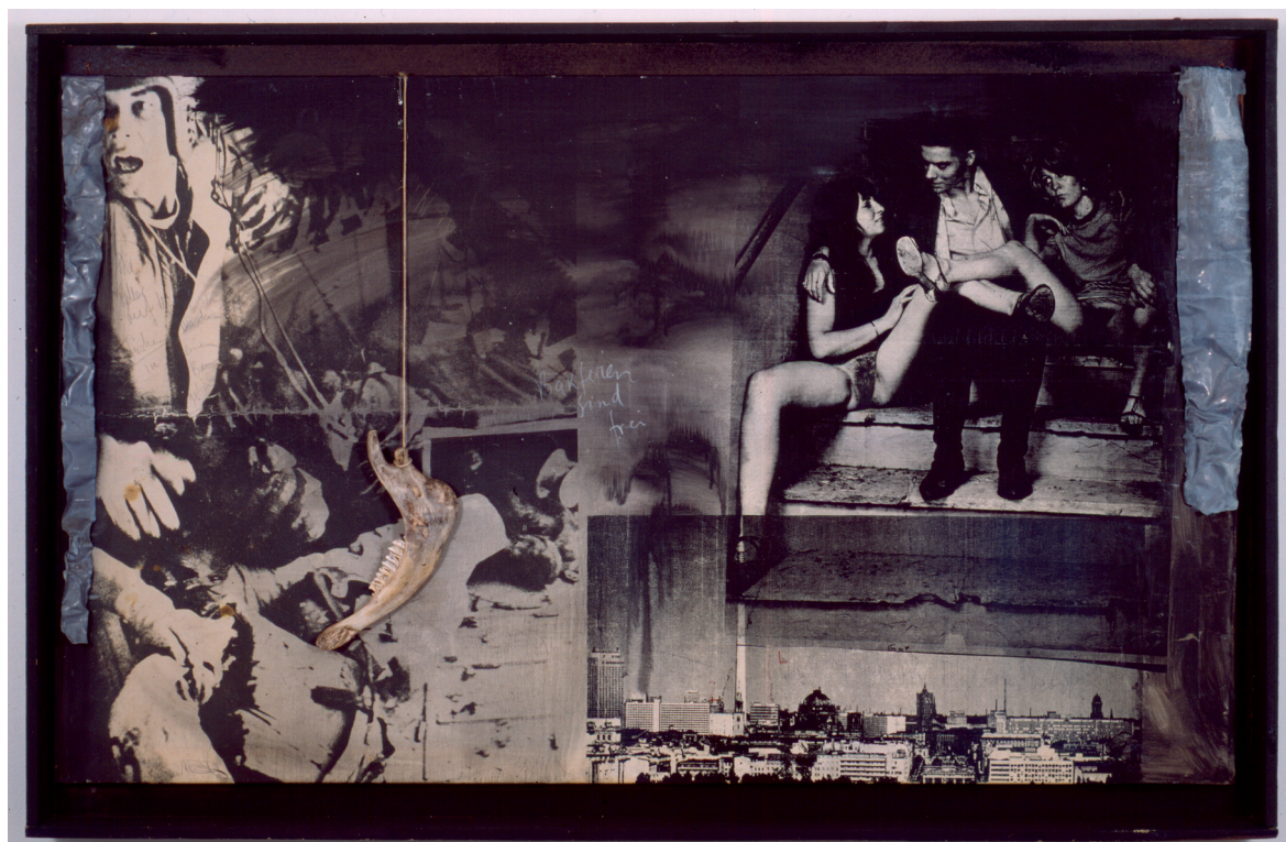
Wolf Vostell, Berlin Fieber , 1973; Acrylic on photo-canvas and objects; 190 x 140 x 20 cm

Wolf Vostell | Destruction is Life is a testimony to the everyday and its dichotomies through works where memory, war, and humanity reverberate on the stage of world history. In Vostell's words, art shall remind us that we must remember.