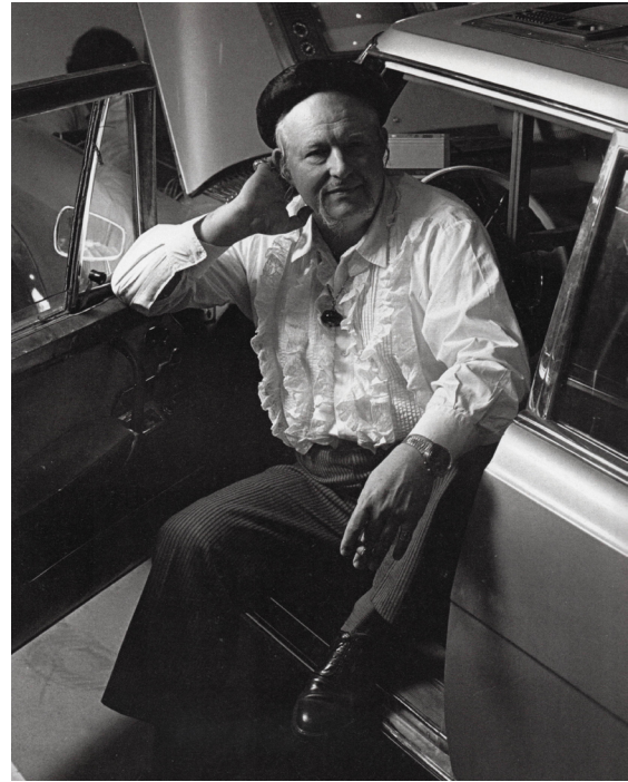
Wolf Vostell, Portrait

Deeply impressed by a trip to Paris in 1954, Vostell created his first "dé-collage", a term used in Le Figaro to describe an airliner's simultaneous takeoff and crash. Dividing the word into syllables to emphasize both the difference and continuity of creative and destructive processes, Vostell employed the term as a symbol of Western epistemology's destructive/creative dialectic, making it the foundational theoretical principle of his practice.