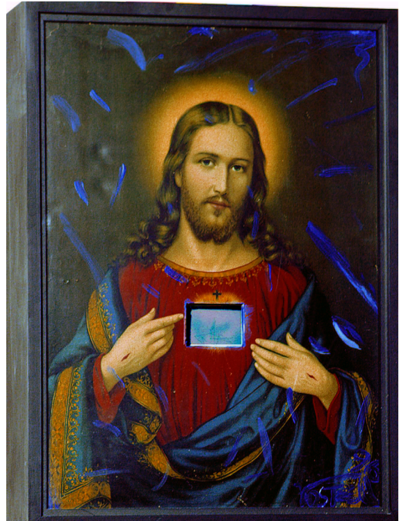
Wolf Vostell, Jesus with TV heart , 1995;

One of the founders of Fluxus, Vostell, was an eclectic pioneer engaged with a variety of media. He was among the first artists to adopt video and installation as essential linguistic tools in his practice and the first to include a television within an artwork in 1958. Through a selection of videos, paintings, sculptures and installations spanning from 1967 to 1998, the exhibition Wolf Vostell | Destruction is Life takes the viewer on a journey unfolding over three floors of the Mayfair townhouse space, examining some of the many facets underpinning Vostell's oeuvre, always with humanity at the centre. Moving beyond the Fluxus attitude of considering life as a work of art, the artist asserted that "every man is a work of art" and how by discovering one's inner life, one can be a work of art.